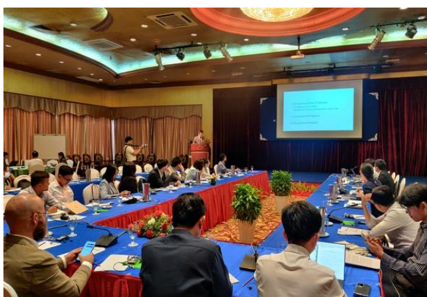
UNICEF "Water and Sanitation" Project Meeting in Cambodia

"China-Pakistan Joint Research on Small Hydropower Technology" which is a "Strategic Scientific and Technological Innovation Cooperation" Key Project under the