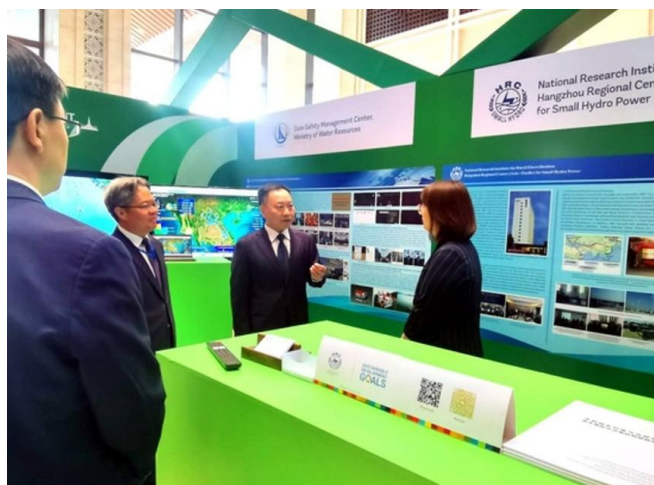
Mr. Li Guoying, Minister of Water Resources of China, visited HRC exhibition booth and exchanged with us

event--Belt and Road Conference on Water Resources and Water Environment, Seminar on Application and Promotion of Small Hydropower Standards, Seminar on Centralized Operation Technology for Multiple Small Hydropower