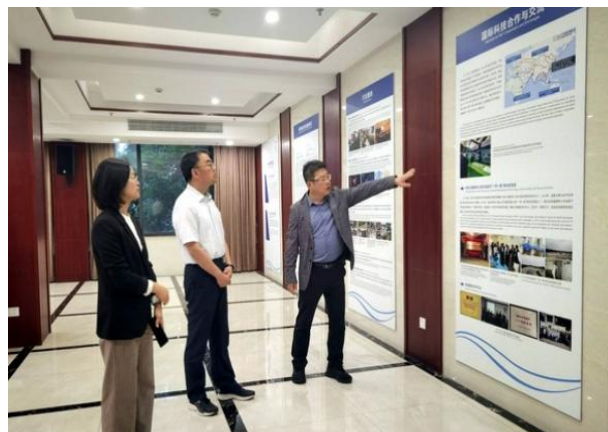
Leaders from AIBO under MOFCOM visited HRC

Entrusted by China International Development Cooperation Agency