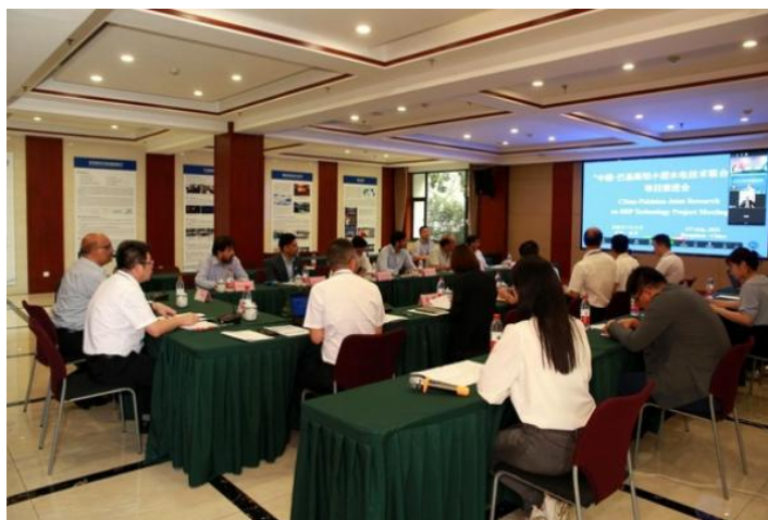
Project Meeting for China-Pakistan Joint Research Project on Small Hydropower

Hydropower Technology with the Pakistan Council of Renewable