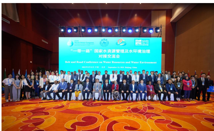
Belt and Road Conference on Water Resources and Water Environment

Stations, and Reunion Meeting of Former Seminar Participants in Cairo, Egypt, etc. In addition, HRC participated in the organization