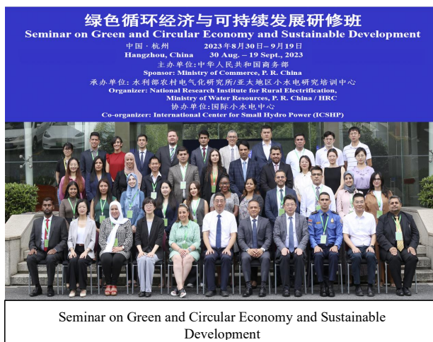
Seminar on Green and Circular Economy and Sustainable Development

Africa and Latin America. In 2023, two offline training programs called Seminar on Green and Circular Economy and Sustainable Development and Seminar on Water Resources