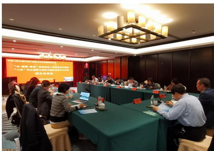
Project Meeting for China-UNDP Partnership on Water Resource Management

implementation of the UNICEF “Water and Sanitation” project, promoting the demonstration and application of off-grid photovoltaic technology,